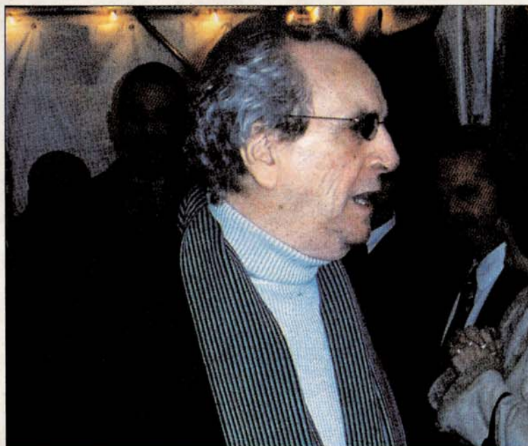
Left: Actor Danny Aiello, who narrates the documentary, makes a red carpet appearance on Nov. 26.