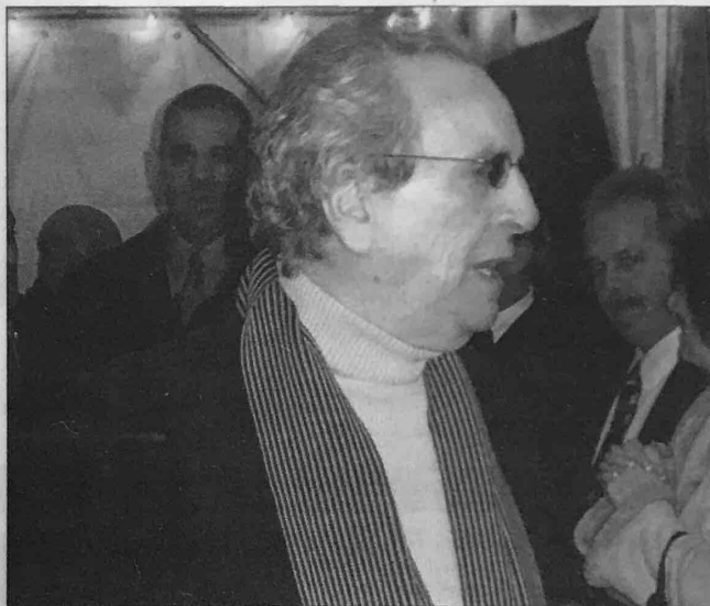
Left: Actor Danny Aiello, who narrates the documentary, makes a red carpet appearance on Nov. 26.