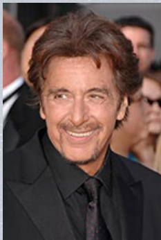
Al Pacino "Big Jack" Zoe's Grandfather