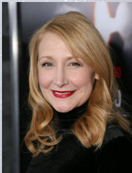
Patricia Clarkson "Elizabeth" Zoe's Mother