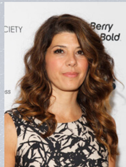
Marisa Tomei "Marie" Zoe's Biological Mother