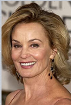
Jessica Lange "Virginia" Jack's Best Friend