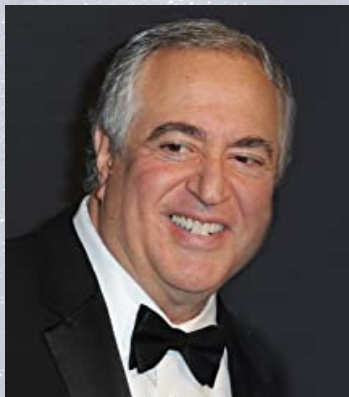
Nick Vallelonga Writer/Producer

Nick Vallelonga is the winner of two academy awards and two Golden Globes for Best Picture and Best Original Screenplay for Green Book (2019). Beyond critical acclaim, Green Book has grossed over $327M to date worldwide.